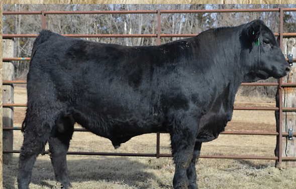
Roth Prowler 466 ~ Lot 6