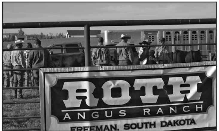
Southeastern Angus Tour