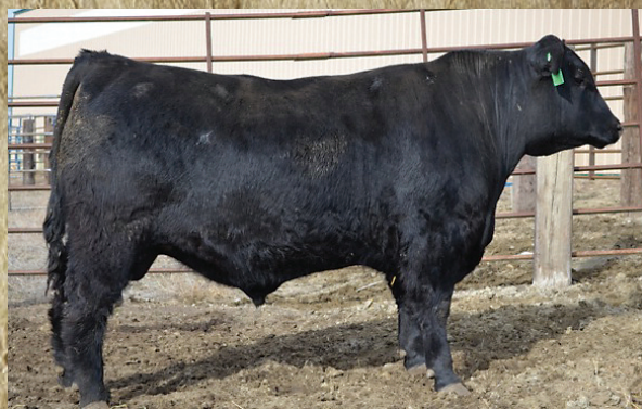
Roth Regis 440 ~ Lot 11

This sale will be broadcast live on the internet.