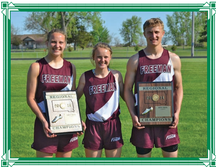
Roth Kids – Girl's and Boy's Teams Regional Champs